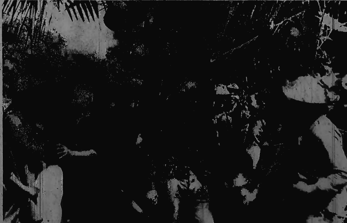
In a liberated village

These earlier struggles soon gave way to battles of