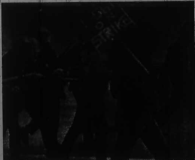
Richmond oil strike