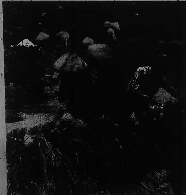
Cooperative farm in North Vietnam

6. SDS must implement the building of a revolutionary youth movement as the only long-range strategy possible for SDS in the international struggle against imperialism.