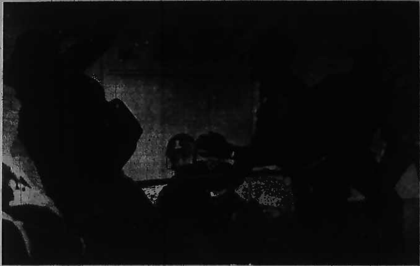
San Francisco State