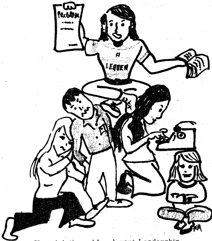
Chauvinistic and Irrelevant Leadership

tensified the very problems they had set out to remedy. At the very minimum, I think it can be shown that the increase of elitism and unrepresentative manipulation by SDS leaders from 1963-1969 was proportional to the progressive dismantling of SDS' original formally democratic structure.